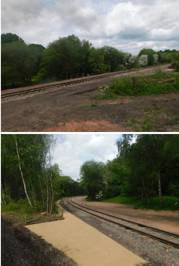
It is a lovely ride over the Staffordshire Moorlands, and the blossom is gorgeous this year. But there is nothing there. We stopped for a few minutes to get steam up for one of the gradients, and continued to nowhere. The line continues, to nowhere else, but the loco runs round, and we go back.

We had a bit of a delay at Cheddleton while they got new gas cylinders into the restaurant coaches, so we were late back to Froghall. The station was heaving, lots of people for lunch.