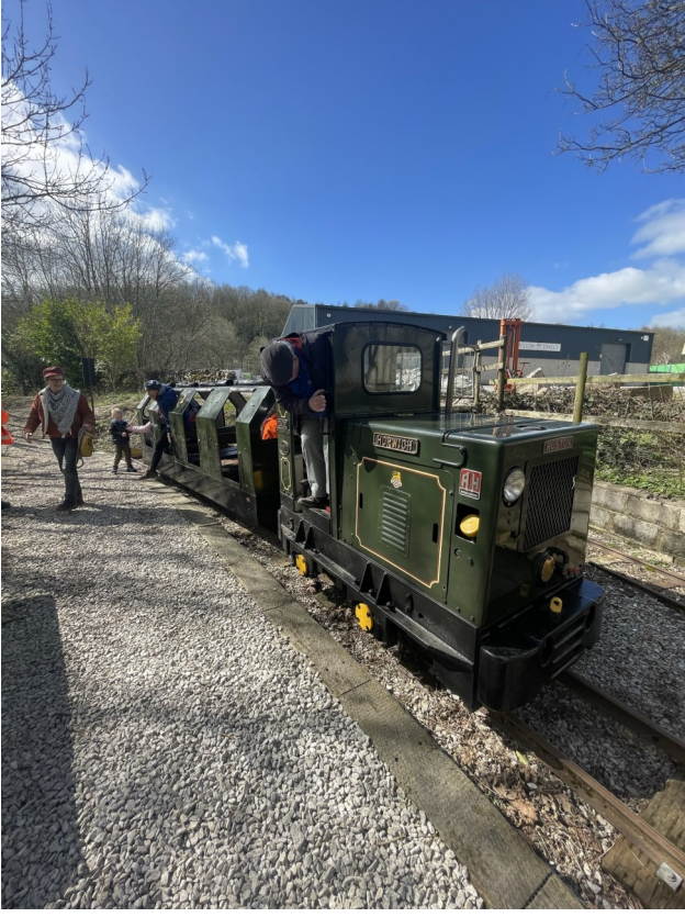
realized he could finally cross it off! (I wish I had not got rid of my spotter books from my teenage years).